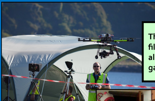
The Japanese film crew had all the latest gadgets!

And not forgetting the wedding of the year!