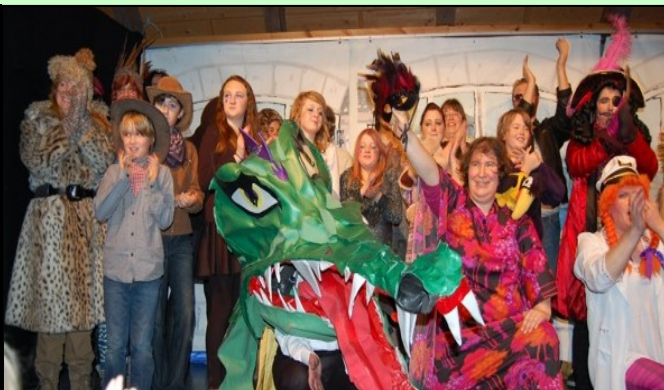
The Cast of Peter 'Gok Wan' Pan