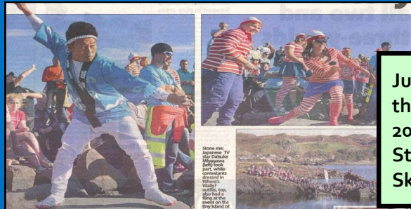
Just some of the PR from the 2013 World Stone Skimming